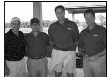
Teams from Boehringer Ingelheim Vetmedica (pictured at left) and Iowa Telecom Communications (pictured at right) enjoyed the 2007 Chamber Golf Tournament.