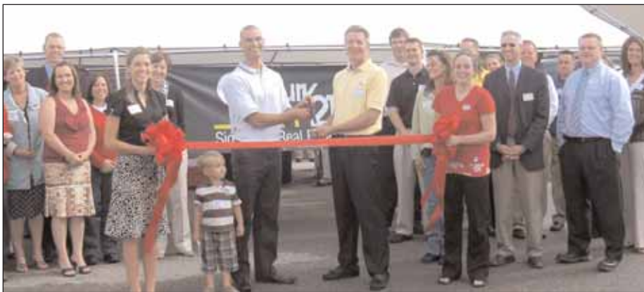
By AMES CHAMBER OF COMMERCE