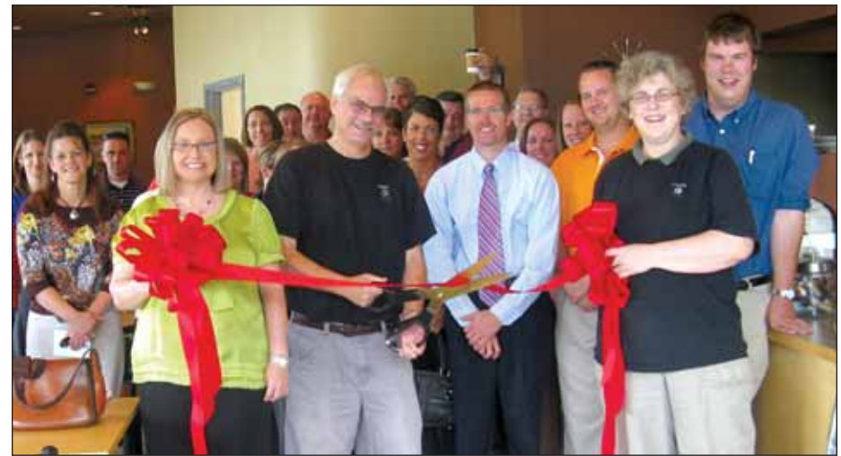
By AMES CHAMBER OF COMMERCE

The Basket Boutique celebrated its one-year anniversary as a retail location with a ribbon cutting on June 2. This business originally opened as a home-based business in 2008. It specializes in fantastic gifts and designs impressive individual gift baskets that are unique, budget-friendly and unforgettable. Its clientele ranges from large corporations and weddings to personalized individual gifts. It also offers a large selection of Iowa wines. Drop by the store at 312 N. Highway 69, Huxley, or call (515) 597-4438 (GIFT), or visit the Web site at www.tbb-giftbaskets.com .