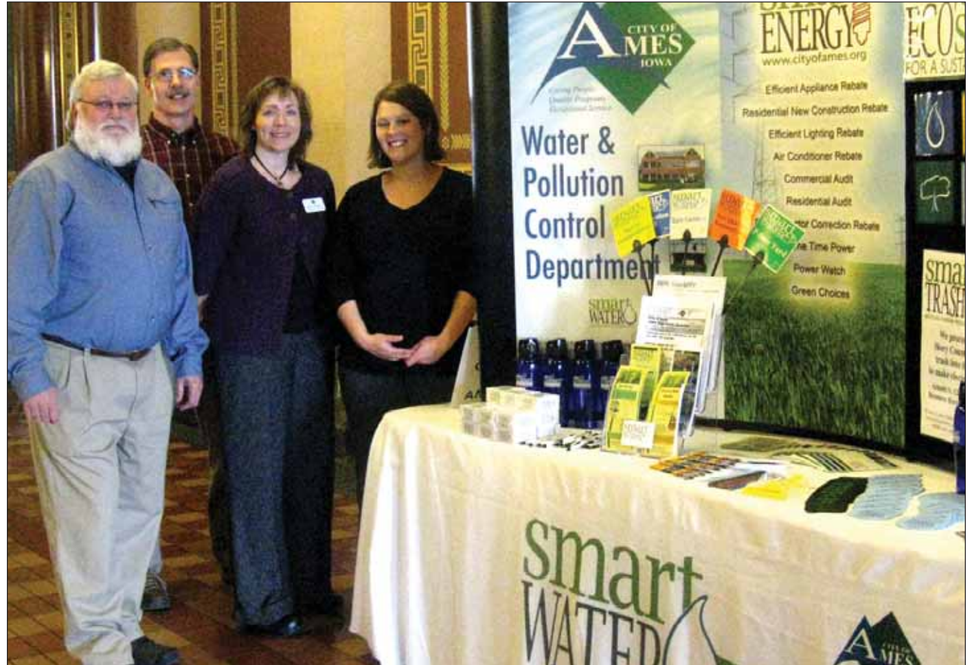
CHAMBER OF COMMERCE PHOTO

Looking to sponsor an upcoming Legislative Luncheon? Support the Ames Business climate and the issues that matter most to our community for only $150.