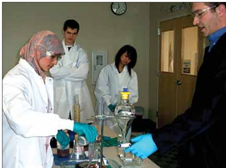
CHAMBER OF COMMERCE PHOTO

For more information, contact Crystal at crystal@ameschamber.com or call the Chamber office at (515) 232-2310.